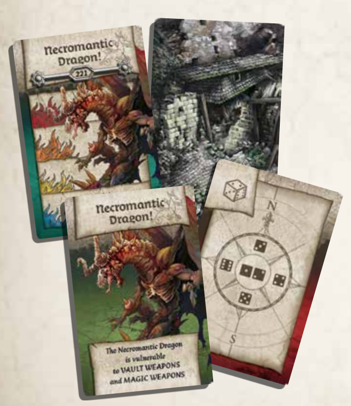
These are the Necromantic Dragon's Zombie cards, Vulnerability cards, and double-sided Compass/Rubble cards.

Wrong! Many brazons battled the zombie hordes head on, without any plan, and were defeated. Raised from the dead as necromantic brazons, the beasts kept most of their former instinct and willpower.